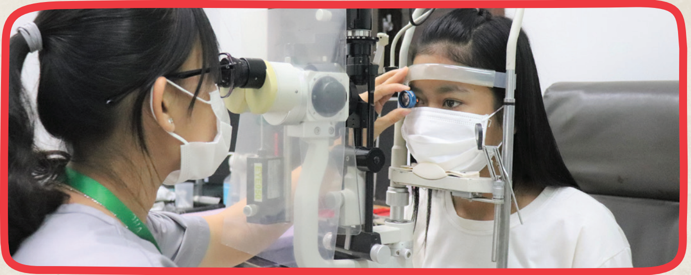
A CAMBODIAN GIRL HAVING AN EYE EXAM