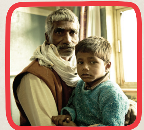
A GRANDFATHER AND GRANDSON AT LUMBINI EYE HOSPITAL, NEPAL